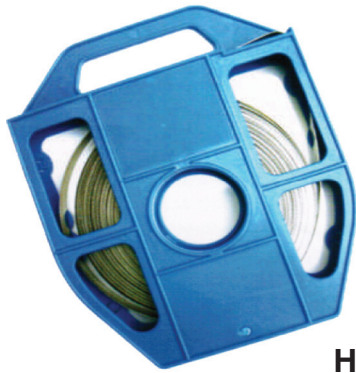
Handy Reel Sold separately